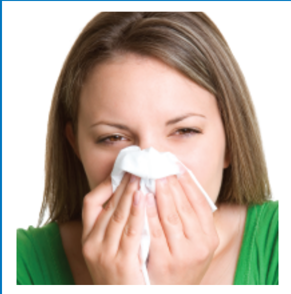
Cover Your Nose & Mouth with a Tissue