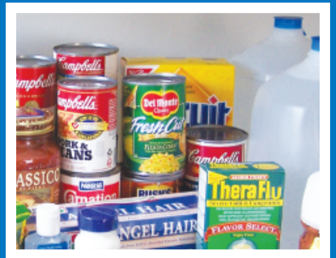
Stock Up on Food, Water & Health Supplies

Pandemic flu is a worldwide outbreak of a new strain of flu virus. During a flu pandemic, millions of people could get sick and even die. Here are things you can do to Be Prepared for Pandemic Flu: