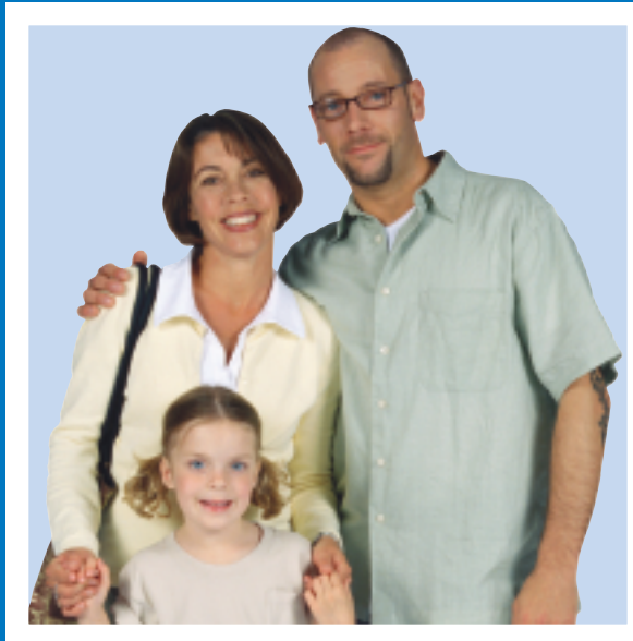
Have a Plan for Your Family