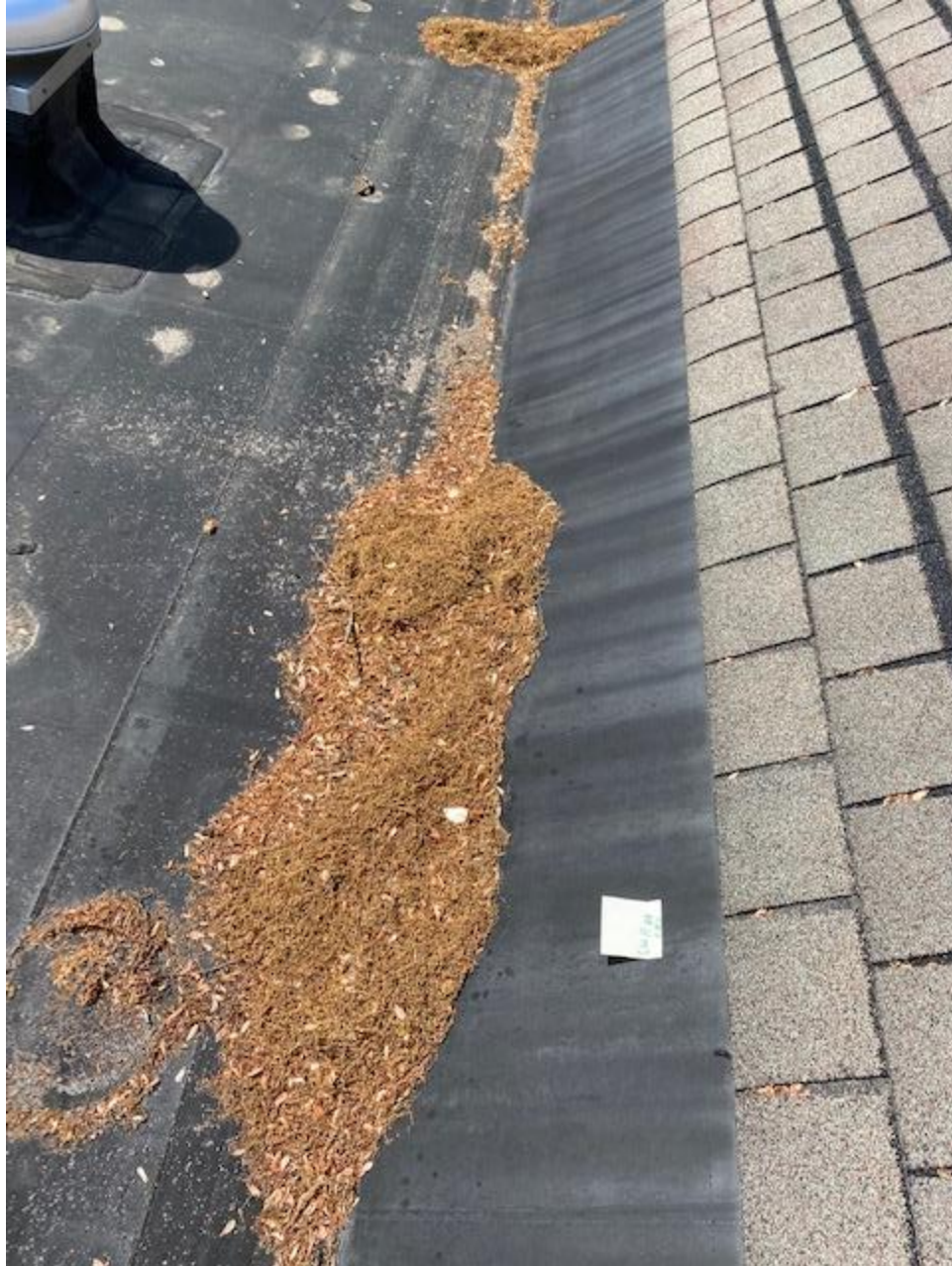
CENTRAL SCHOOL PICTURE #3 SECTION B – DEBRIS REMOVAL