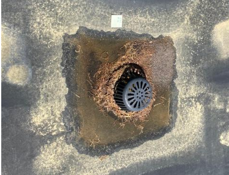
CENTRAL SCHOOL PICTURE #12