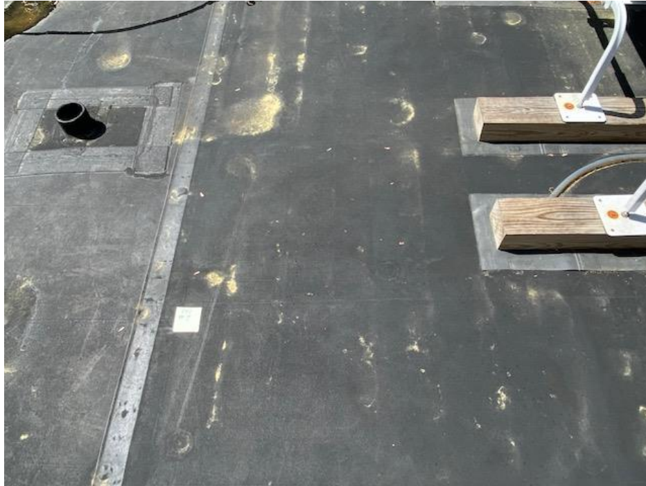
CENTRAL SCHOOL PICTURE #9 SECTION B – EPDM ROOF FAIR CONDITION