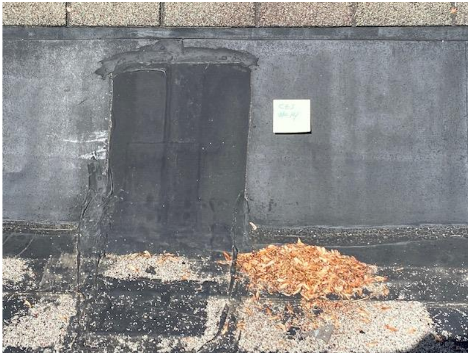
CENTRAL SCHOOL PICTURE #14