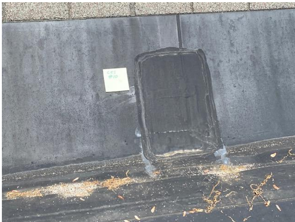
CENTRAL SCHOOL PICTURE #10 SECTION B – HOLE AT A-B TRANSITION