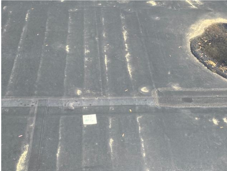
CENTRAL SCHOOL PICTURE #6 SECTION B – EPDM ROOF FAIR CONDITION