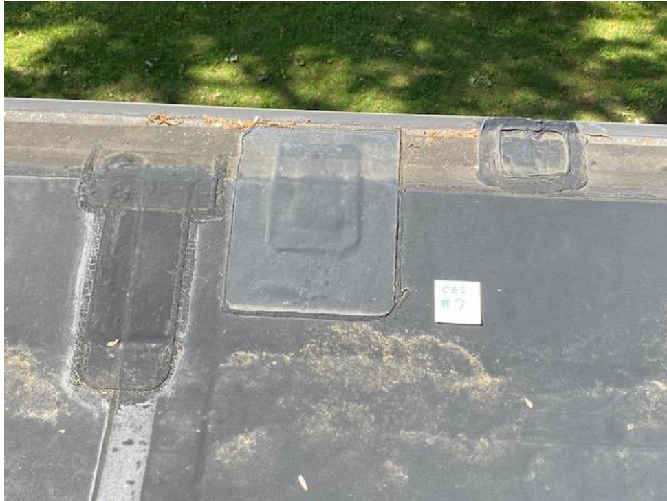
CENTRAL SCHOOL PICTURE #7 SECTION B – SPLIT AT SOUTH EDGE