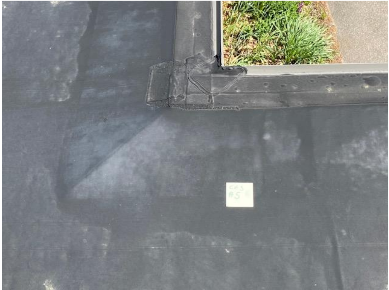
CENTRAL SCHOOL PICTURE #5 SECTION B – EPDM ROOF FAIR CONDITION