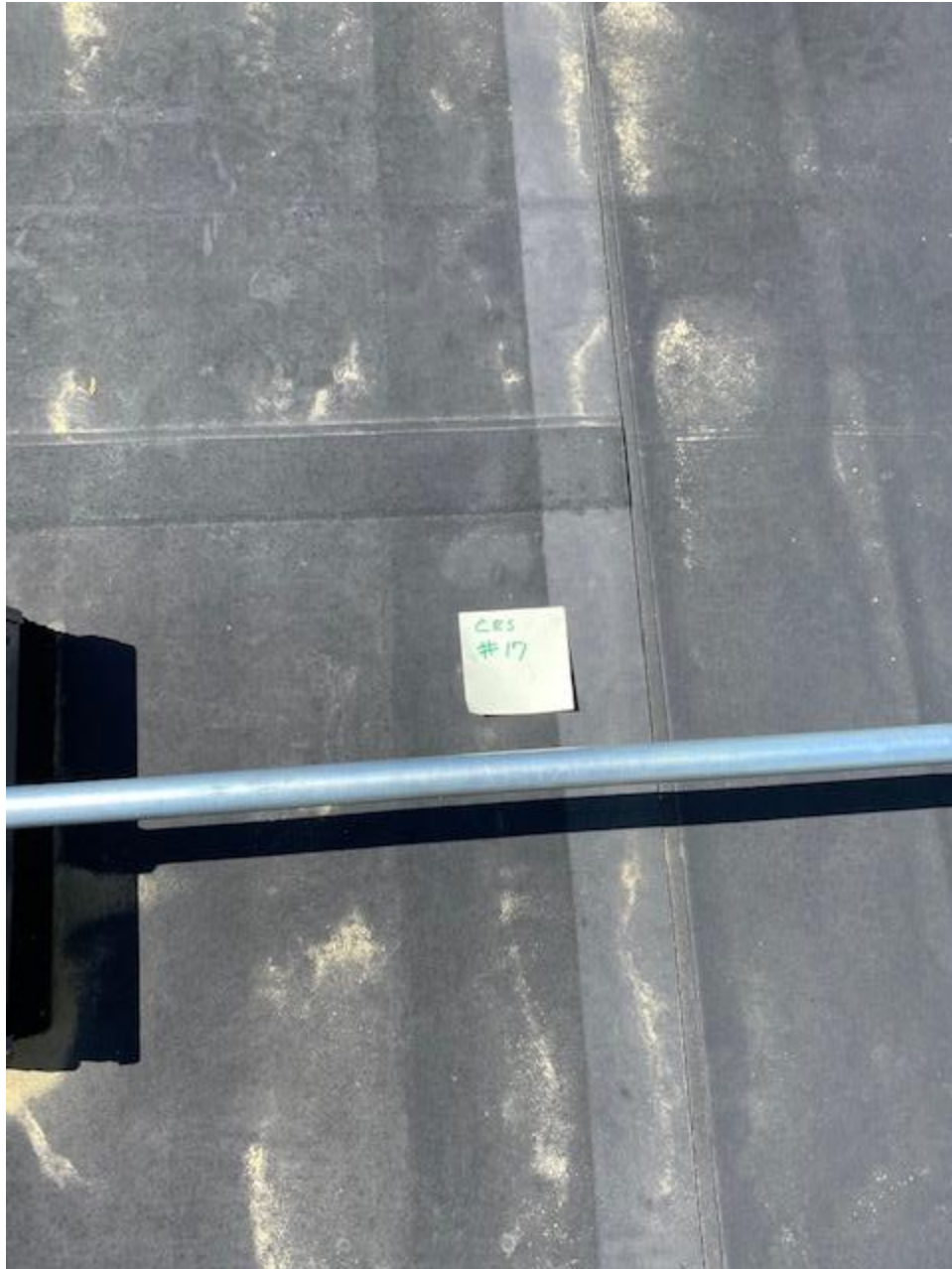
CENTRAL SCHOOL PICTURE #17 SECTION B – EPDM ROOF FAIR CONDITION